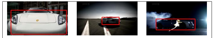
Fig. 1. Car detections from our approach in frames where [1] could not localize the same object with such accuracy. We use the localization in neighboring frames to interpret the location in any given frame, resulting in more accurate and faster detection.

In recent years, there has been significant progress in recognising generic objects such as chair , bus , potted plant , etc. from images [2]. Object recognition is typically posed as a classification problem. Features and classifiers are carefully selected and trained for this purpose. Use of dense SIFT-like descriptors and SVM-like discriminative classifiers have become the widely accepted candidates for visual recognition [4], [5], [6]. The localization of objects is typically performed using the sliding-window technique [7]. A window is moved across the image, each window is classified against the recognition engine. Multiple scales and aspect-ratios are